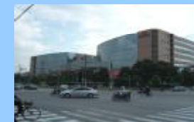
ESC China in Shanghai